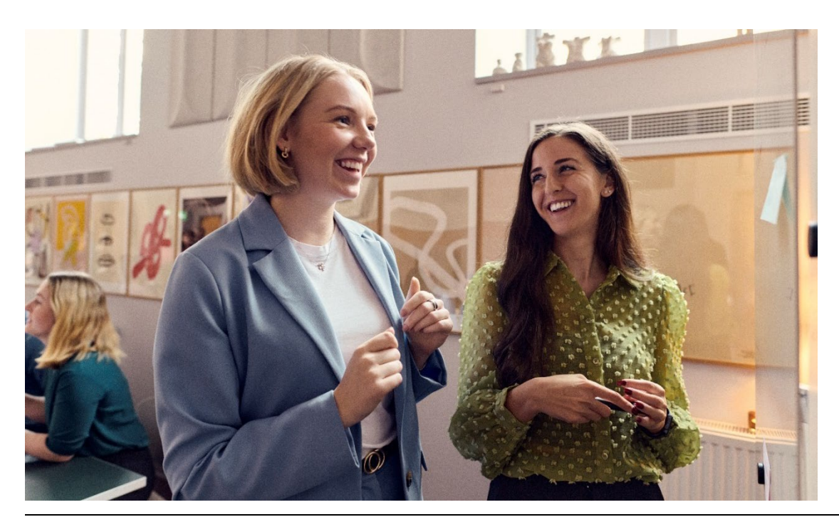
11 (18) | Human Rights report spring 2024